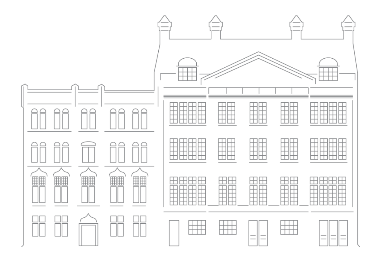
AMSTERDAM | DUSSELDORF | GENEVA | ISTANBUL